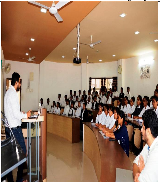
Hon Pranav Thorat Sir interacting with students during the training programme (Day 2)