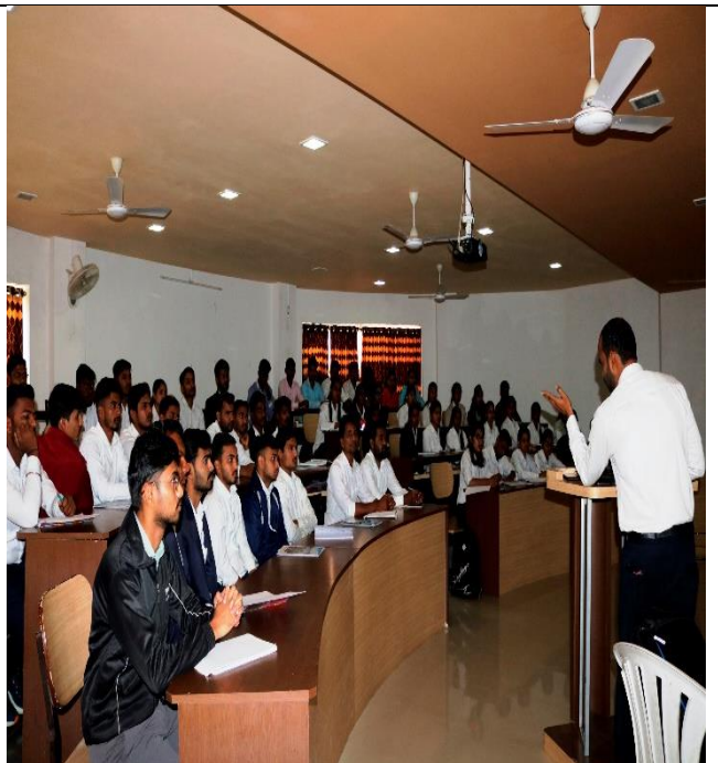
Hon Vishal Shinde Sir interacting with students during the training programme (Day 2)