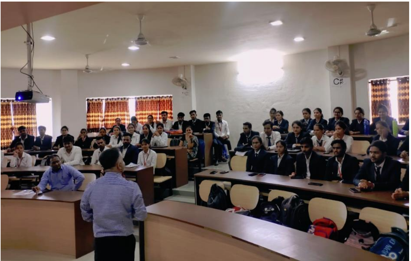
Workshop On Research Methodology