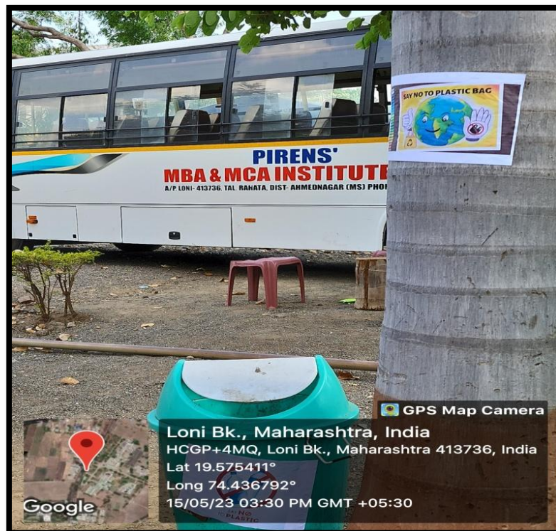
No Plastic Bags