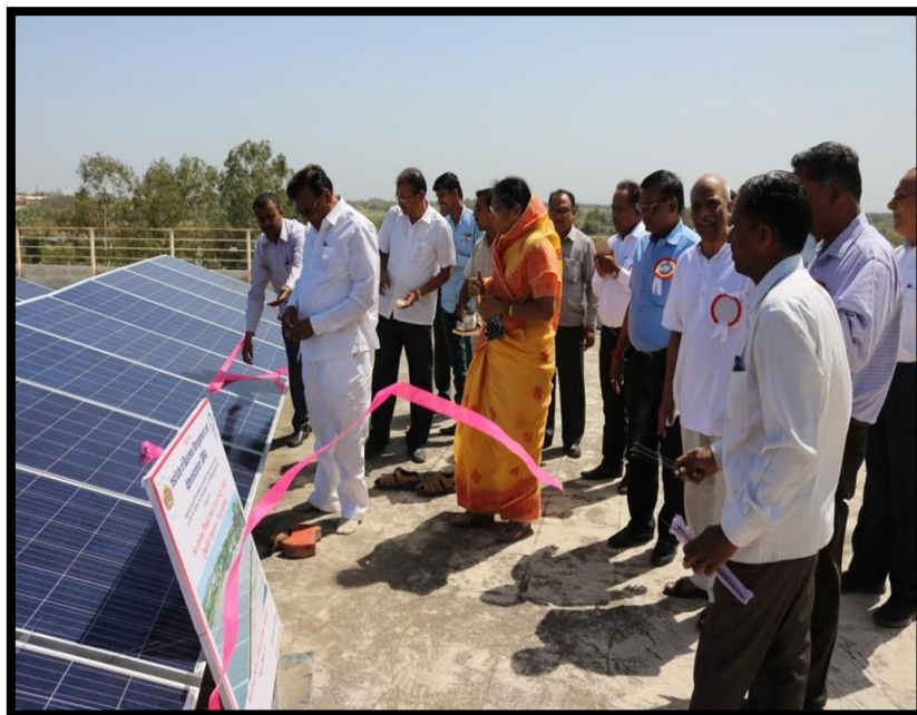
Inauguration of Rooftop Solar Photo Voltaic System PV Type-Hybrid (15KWP)