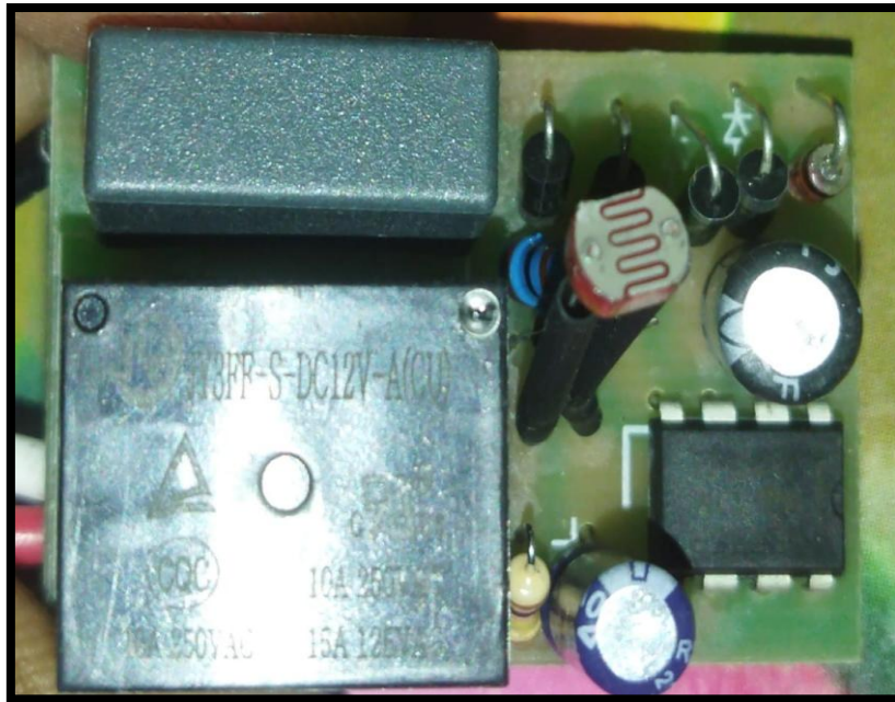
Circuit Diagram and implementation of Sensor based Automatic Light on/off system